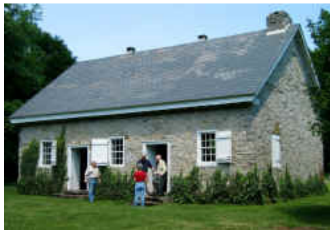
Maiden Creek Meetinghouse 27 West Shore Drive Just east of Kindt's Corner Shoemakersville, PA, 19555

Note: The church will have a regular summer service at the church at 10:30 a.m. Members and friends may choose which to attend.